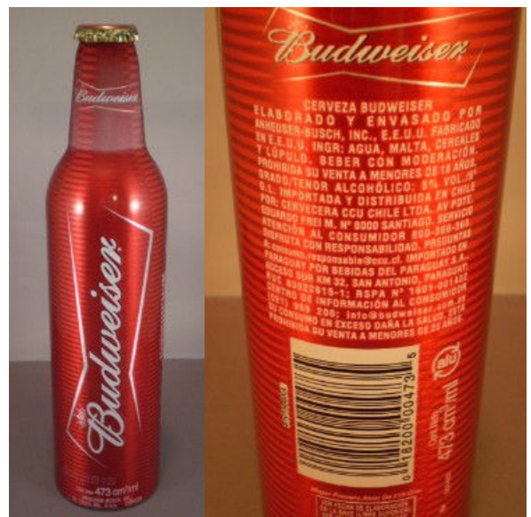
Budweiser 'Paraguay' 501432 473ml (16oz) non-redem