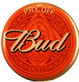
'Bud' Caps found on the Ireland and Argentina export bottles

Two new Budweiser's did surface, both are export bottles. The first is the Paraguay bottle. It's a standard silver version with the white bottom front info in milliliter. The back is real similar to the Argentina bottle, with different wording. The cap is a standard Budweiser bow-tie rather than the 'Bud' cap found on the Argentina. The second bottle to surface was an Ireland export. Again a standard silver with white bottom front except it simply says 'BEER' with 473ml and alcohol content, no AB info on front. The back is also much different than most, just brewed by AB and imported by Guinness along with the web address. The cap is a "Bud" cap, like the Argentina bottle.