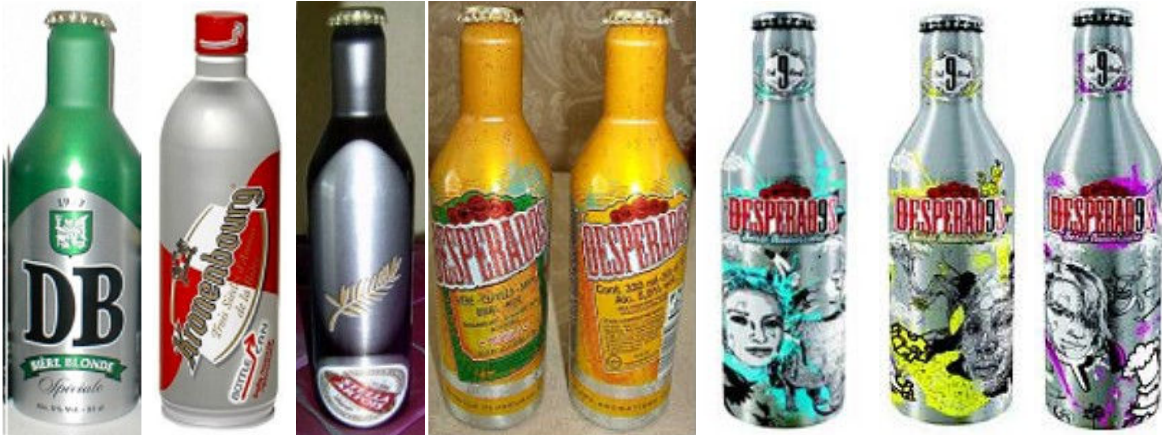
France; DB Blonde Speciale 300ml, Kronenbourg, Stella Artois Cannes Festival 2004, Deperados 1st Edition 330ml front/back shown, Desperados 9eme Concept Cyan 330ml, Desperados 9eme Concept Jaune 330ml, Desperados 9eme Concept Magenta 330ml