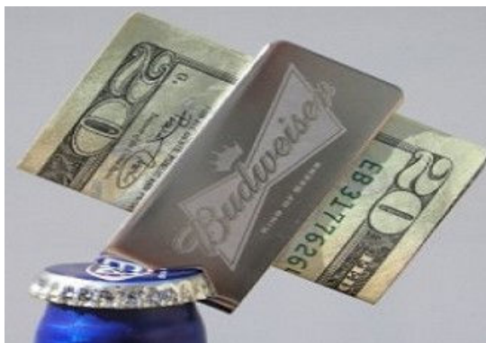
Looks like it would be pretty handy. Of coarse you wouldn't want to use it on a tough cap.