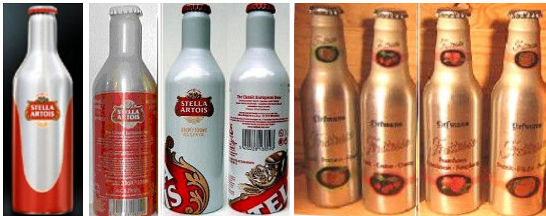
Belgium; Stella Artois 1st Edition 330ml, Stella Artois 330ml, Stella Artois 2nd Edition 330ml front/back shown, Liefmans 4 bottle set