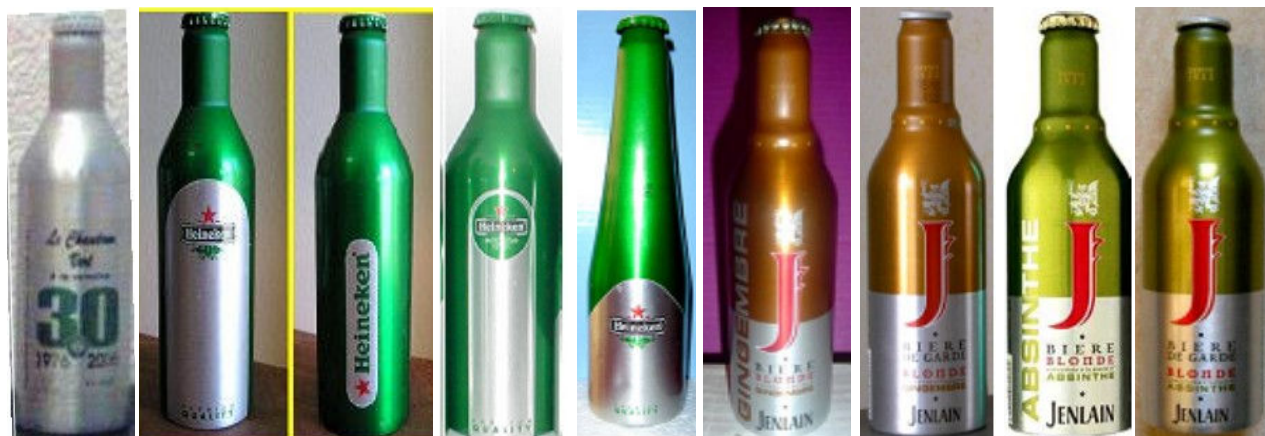
France; Chaudron Vert 30th UEFA Cup 1976 300ml, Heineken Paco 330ml front/back shown, Heineken Circle, Heineken Cone, Jenlain Biere Blonde Gingembre, Jenlain Biere Degarde Blonde Gingembre, Jenlain Biere Blonde Absinthe, Jenlain Biere Degarde Blonde Absinthe