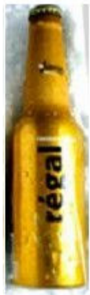
Luxembourg; Simon Regal 330ml