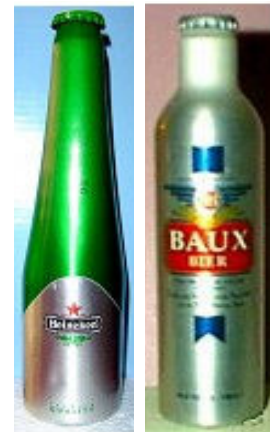
UK; Heineken Cone (import), Baux Beer 330ml