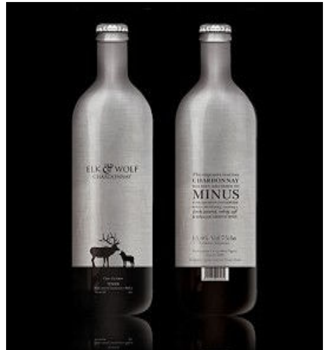
Brushed aluminum wine bottles designed by Social UK. Well if the beer bottles don't pick up...