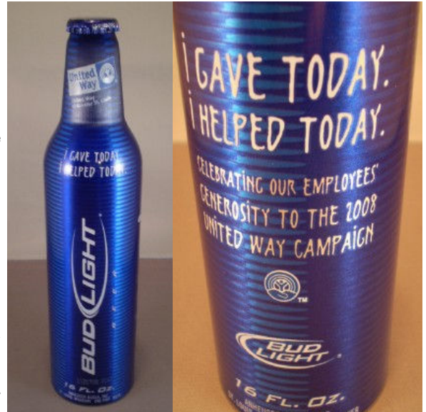
Bud Light 'United Way 08' 501430 16oz redemption