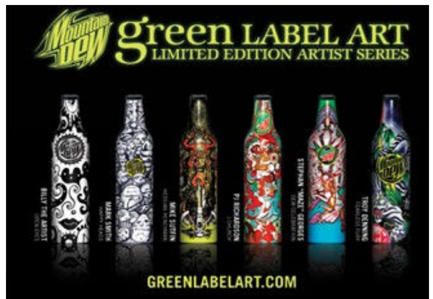
The Dew posters usually show up around the displays. Most retailers won't put them out though, so if you know someone.