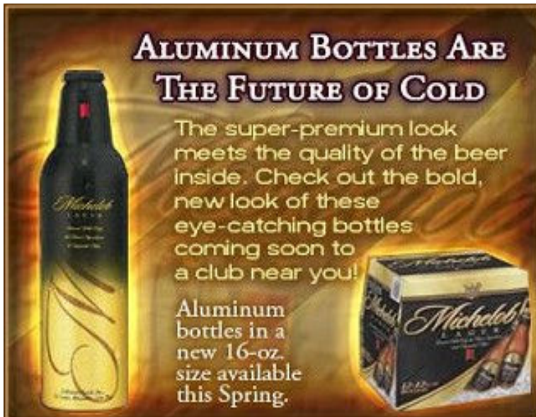
An oldie but a goodie. If you can find the POS flyers, they always make good collectibles.

A few things found that always make interesting go-with's. Many thanks to Bob Renforth ABC# 001 for the pictures.