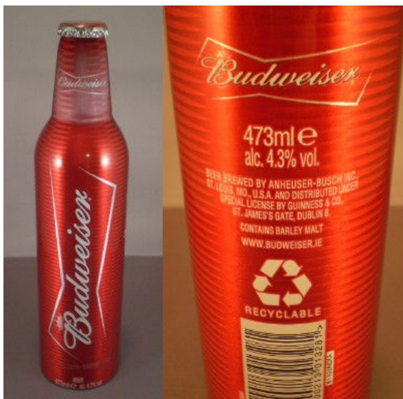
Budweiser 'Ireland' 501386 473ml (16oz) non-redem