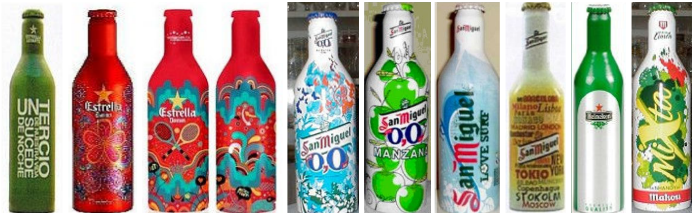
Spain; Estrella Levante Ltd Ed, Estrella Damm Custo 09, Estrella Damm Master Series front/back shown, San Miguel 0.0%, San Miguel 0.0% Manzanas, San Miguel 0.0% Love Surf, San Miguel Ciudades del Mundo, Heineken Paco (brewed in Sevilla) 330ml, Mixta Mahou