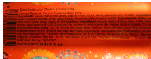
Estrella Damm back panel and front view 330ml