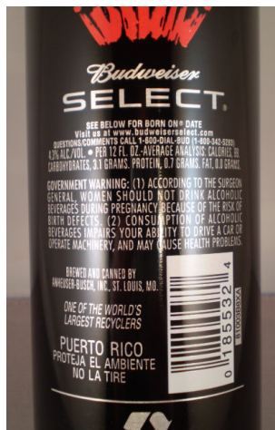
Back panel of Bud Select 'Puerto Rico' 501204 16oz non-redem