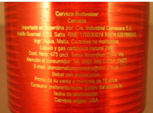
Argentine mandatory info sticker

I'll start this series by talking about some of the 'Sticker' variations. There are four known "Sticker" variations and all were for export. Three were for export to Argentina and a lesser known variation was for England.