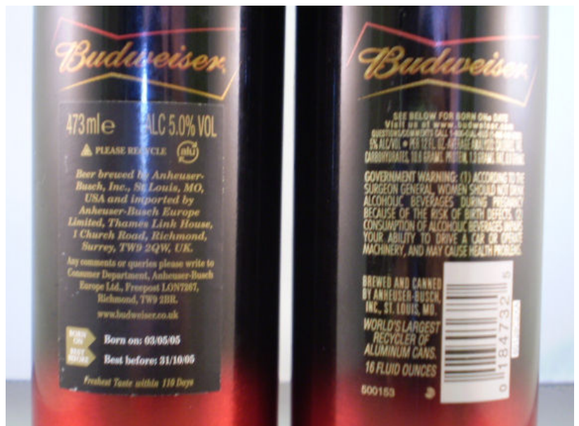
Budweiser English variation with a regular 500153 shown on right