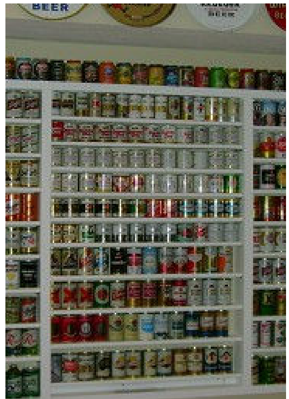
My real passion, 7 oz, 8 oz, 10 oz and 11 oz flats and zips (in the center)