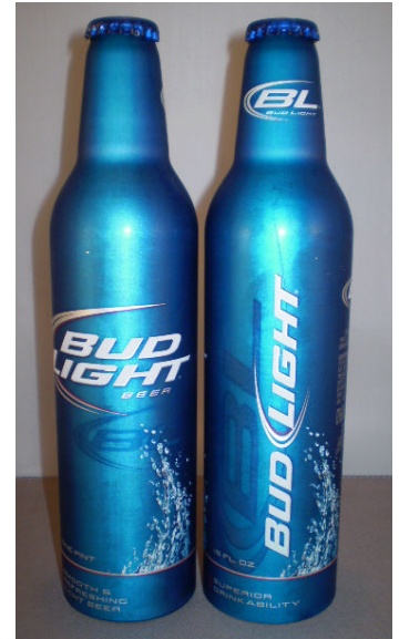
Bud Light 'Superior Drinkability'