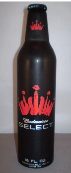
Bud Select Larger Text