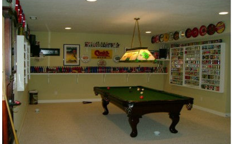
The Man Cave – or Mantopia as I like to call it

I got the Aluminum Bottle bug probably about a year after the first were released, so I'm missing the earliest bottles in my collection, having filled in a lot of the early ones by purchasing Mark Austin's collection in 07... I do not actively seek out Foreign bottles, but I have a few in the collection.... If I come across a good trade I'll pick them up. I try to collect the A/B bottles but I don't collect all the variations of each release, pretty much all of mine are redemption versions. I also do not have the New Years or Halloween black light bottles... I'm curious if we will see more Micro Breweries experiment with the aluminum bottles like Blvd. That would add a brand new dimension to the hobby ... By the going rate of the Halloween bottle these days, we might be the first to collect this legacy collectable!