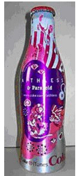
Coca Cola "Faithless & Paranoid" bottle from Hungary. I have no other info on this one but why do I feel that there was a party involved somewhere along the way. With a title like that, it has to be good. Reminds me of my Senior year in High School.