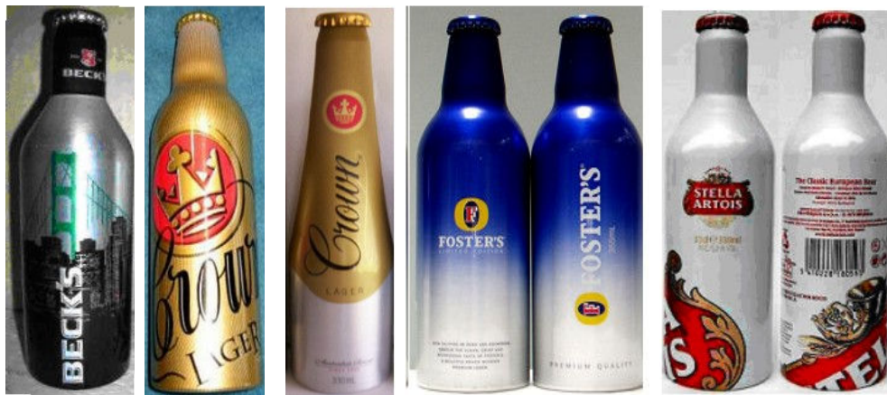
Australia: Becks 330ml, Crown Lager 330ml, Crown Lager 2008 330ml, Fosters 330ml, Stella Artois 2nd Edition 330ml

GEORGIA: A non-traditional cabottles producer, surprised us with a 500 cc. "Kazbegi Platinum" tall and attractive. A good one to have at home.