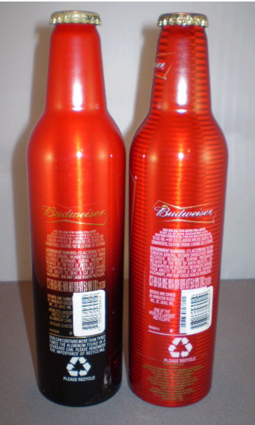
Budweiser Argentina 500358 and 500611 showing rear UPC and mandatory stickers

In addition to my regular 'What's New in A-B' column I've decided to occasionally touch on some of the lesser known/questionable A-B variations. I'm doing this to help clear up some questions on these as they can be somewhat confusing. There are quite a few A-B variations floating around that some may consider not worth the trouble to collect as they are so close to another variation or the change may seem to be a mute point. Well being an Anheuser-Busch only collector (aluminum bottles and cans), I live and die by the variations. Not to mention the fact that some of them are pretty cool.