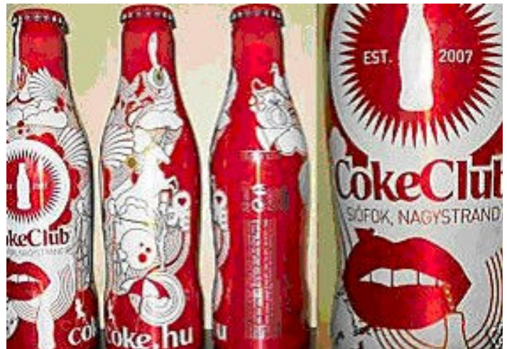
The eBay description on this reads "There was a large house party at lake Balaton this summer, and this bottle was distributed there as a promotional gift to all the visitors. (This special event was sponsored by the Coca Cola, of course.) Only 20000 pieces were made. So this is the rarest Coke aluminum bottle in Hungary." Must have been one heck of a party. I am seeing a pattern to events in Hungary!

Even though it seems like the production of beer aluminum bottles has slowed, the soda ones just keep coming! Here are a few that I spotted on eBay recently. If you are needing to find something new to collect, you might look at the recent offerings from Coca-Cola international. They are really getting with it on the graphics and colors. And being Coke, you know there are people world wide going after them