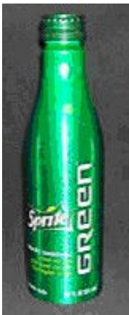
The claim on this one is that it is the first Sprite aluminum bottle ever. These bottles were not sold retail in the USA. Produced by The Coca-Cola Company