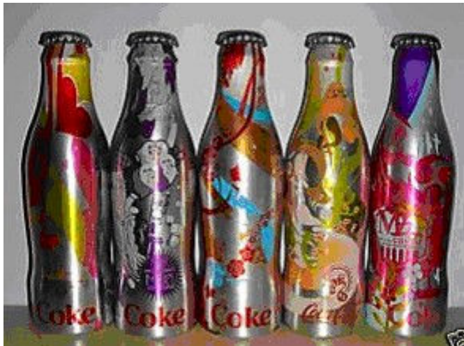
I am not sure if I have shown this full set before. If not, here it is. This is the Coca-Cola M5 aluminum bottle set from Belgium