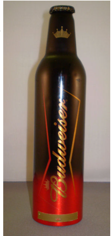
Budweiser English variation showing bottom front sticker

The weird part about all these variations is the fact that these stickers had to be placed pretty precise. What a tedious job that must have been.