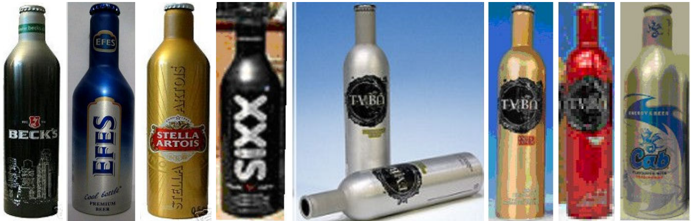
Russia: Becks, Efes, Stella Artois, Sixx 330ml, Tabu Silver , Tabu Gold, Tabu Red, Cab Dragonfruit 330ml