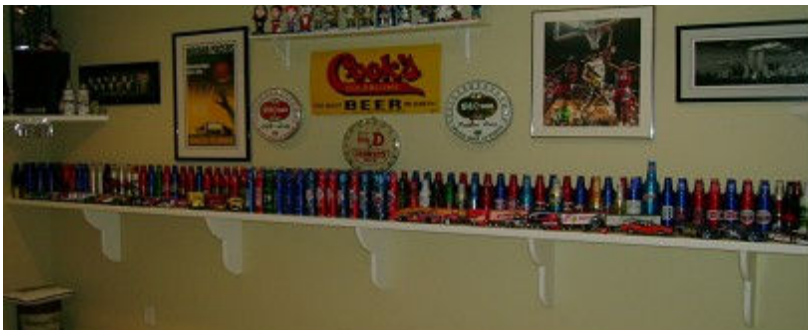
Obviously I need a better display solution, I'm working on it!