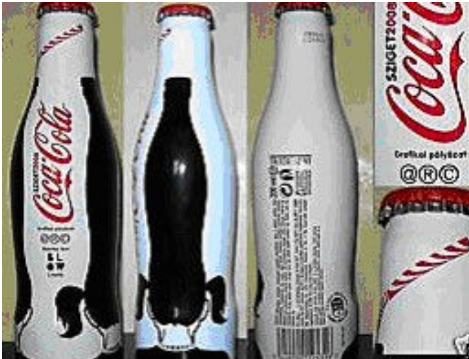
Coca-Cola Sziget Festival - Aluminum bottle from Hungary This bottle was never sold in shops. Limited production of 30,000 for a Hungarian music festival. Must have been quite a festival!

Even though it seems like the production of beer aluminum bottles has slowed, the soda ones just keep coming! Here are a few that I spotted on eBay recently. If you are needing to find something new to collect, you might look at the recent offerings from Coca-Cola international. They are really getting with it on the graphics and colors. And being Coke, you know there are people world wide going after them