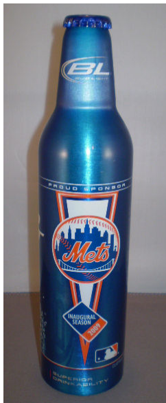
Boston Red Sox