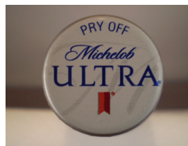
New white cap found on Michelob Ultras