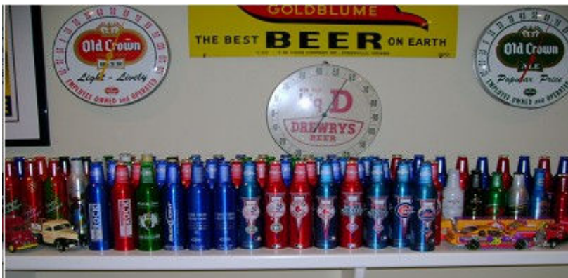
Stacked 3 deep! Who wants to come over and help build shelves?!

Editors Note: Many thanks to Chip for taking a few minutes to show us his collection. Any and all members are welcome to share their collections here. Simply send it in and I will get it posted.