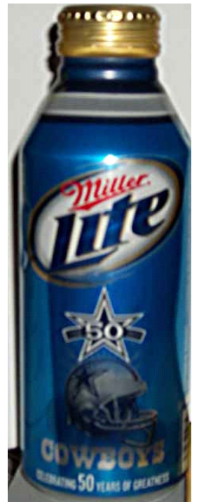
Dallas Cowboys 838049