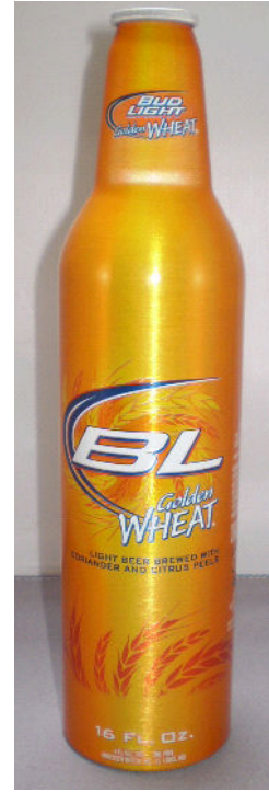
Bud Light 'Golden Wheat' 501658 16oz redemption