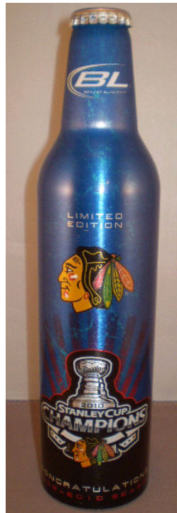
Bud Light Chicago Blackhawks 501659 16oz redemption

Finally two different Bud Light championship bottles has been released. One for the Chicago Blackhawks Stanley Cup win and another for the New Orleans Saints Super Bowl win from earlier this year. Since A-B backed off on the MLB series they appear to now be just centering on the championships for a particular sport. Keep an eye out for a NBA Champ Lakers bottle and whoever happens to win the World Series will probably get one also. Hopefully I'm not the one starting rumors, but...