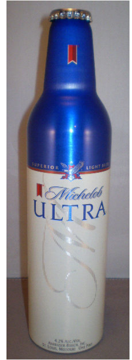
Michelob Ultra 501637 16oz redemption non-redem and 3.2 not yet verified