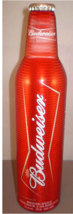
Budweiser 'Canada' 501334 473 ml

Michelob Ultra has changed the label around some. Nothing drastic but a whole bunch of little changes.