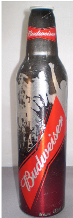
Budweiser 'Osheaga Music Festival' 501640 473 ml

The long awaited release of the Budweiser 'Osheaga Music Festival' bottle has finally arrived. Probably one of the most drastic design changes we've seen since the Bud 'St Pats' Day bottle. There has also been rumors that the was to be a Bud for the Canada IZOD race, not true. I can never figure out how these rumors get started...