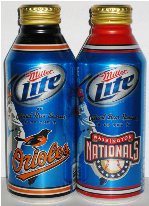
Better Photos of two that slipped into the last issue: Orioles 837271; Nationals 837270