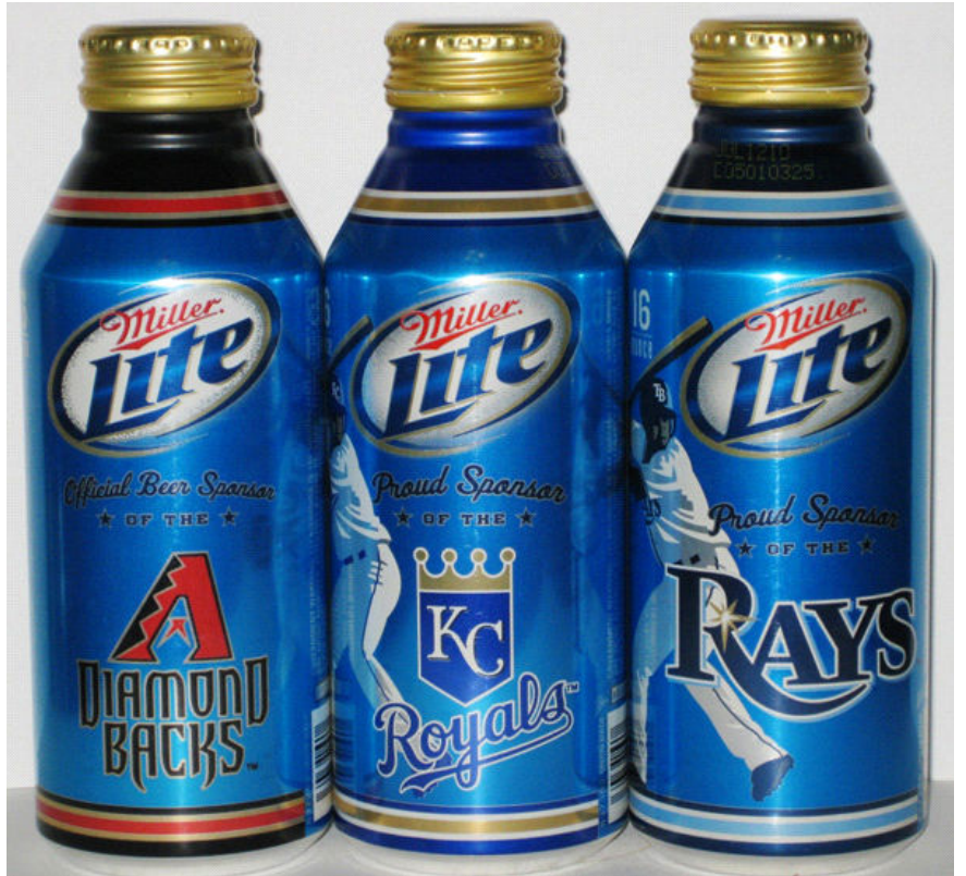
Diamond-Backs 837267; Royals 837302; Rays 837266