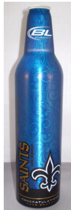
Bud Light New Orleans Saints 501638 16oz redemption

Many photos of these and other A-B bottles available at: www.abcchapter.com