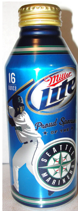
Seattle Mariners 837265