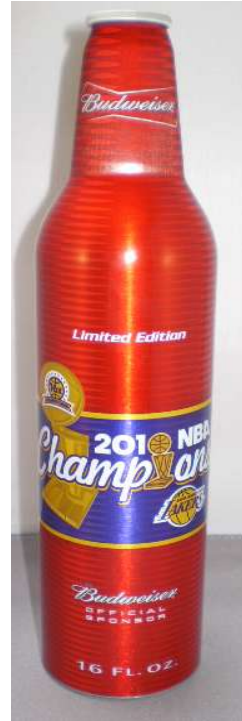
Budweiser 'LA Lakers' 501639 16oz redemption