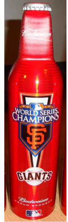
Budweiser San Francisco Giants 500450 16oz redemption

The long awaited Budweiser LA Lakers Championship bottle has finally arrived. I was starting to wonder if this would be released before the Lakers win another.