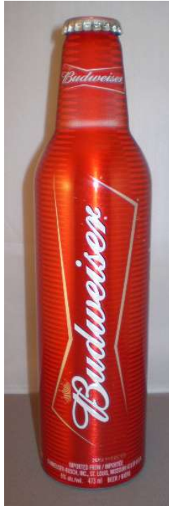
Budweiser 'Canada' 501656 473 ml