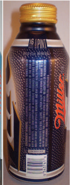
Cowboys 3.2 839441

Last but not least, is another one from Heineken. This was an overlooked release from 2007 or so which was intended for bars. The 11.2 oz redemption bottle includes a government warning yet no UPC bar code, making store sales somewhat tough.