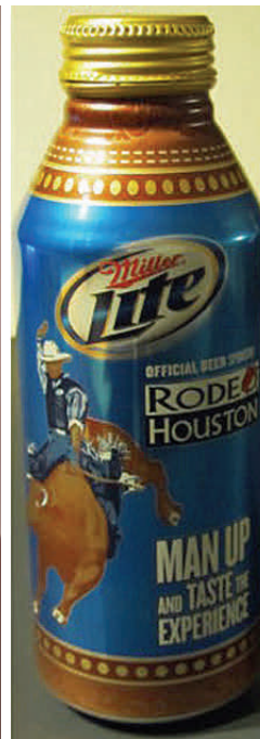
Houston Rodeo 840213