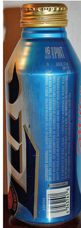
Miller Lite 3.2 838368

Just when we thought the Heineken STR bottle was a one shot and done, a variation is discovered. The bottle originally listed and the one most of us found was the 01002, which has the 'Enjoy Responsibly' logo and web address on the bottom of the back panel. The variation, 01004, has the same info at the top of the back panel. Once again, check those variations.