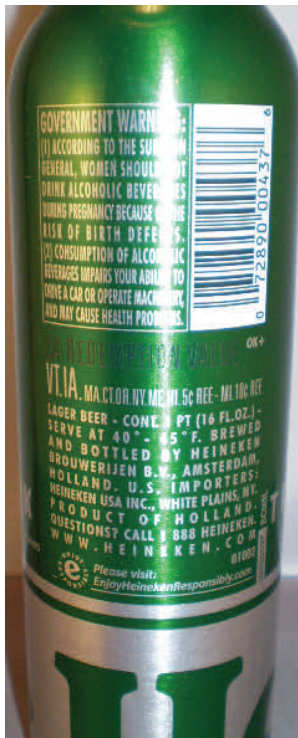
Heineken STR 01002

Last but not least, is another one from Heineken. This was an overlooked release from 2007 or so which was intended for bars. The 11.2 oz redemption bottle includes a government warning yet no UPC bar code, making store sales somewhat tough.