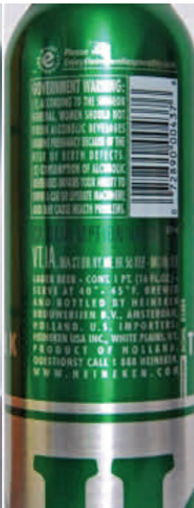
Heineken STR 01004