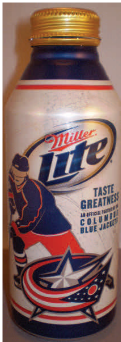
Blue Jackets 840203

From the original release sheet mentioned above, be on the lookout for Brewers, Cubs, Diamondbacks, Dodgers, Padres, Royals and White Sox. Of course, with the addition of Detroit there may be others or we may not see all that were intended for release. (see release pics)