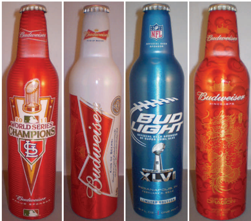
Budweiser Cards Champs

Championships seem to be a theme with A-B bottles so why should the Super Bowl be any different. The Bud Light New York Giants Championship bottle, 501859 16 oz redemption (a 16 oz non-redemption is also rumored to exist, but no confirmation yet), actually showed up about a week before the Super Bowl, along with a Patriots bottle. This was another one of those cases where bottles mysteriously show up on eBay and false information is spread everywhere. The first rumor was these bottles were for the Conference titles and only 75,000 of each were made, which turned out to be totally false. Both bottles were ran for the potential champs and only a pallet or so were filled prior to the game. The winners, Giants, are then mass produced and available everywhere. The losers were to be destroyed, but a few have survived. For more info on the Patriots bottle (along with the Rangers) see Bobs article on page 3.